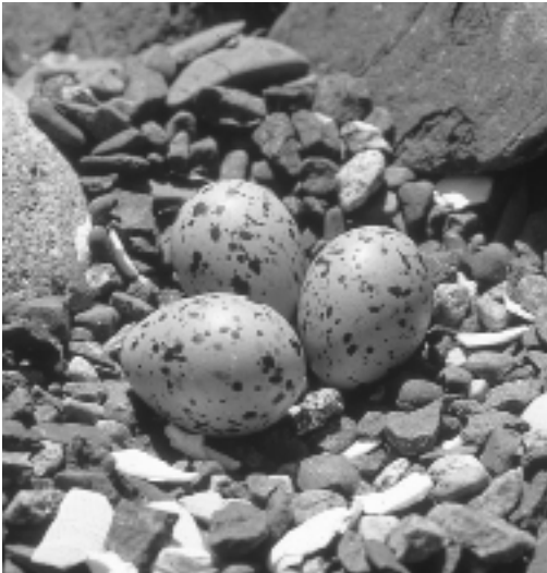
Figure 3. Historical information has revealed that Black Oystercatcher has nested on Chain Islets, off southern Vancouver Island, BC, for at least 11 decades.

(7) Two eggs were collected at Seabird Rocks, BC, by Newcombe on 1 June 1896 (Macoun 1900, Carter et al. in press). Although at least five clutches of Black Oystercatcher eggs and two chicks were obtained between 1892 and 1896, Fannin (1898) repeated his quote from 1891 regarding the Black Oystercatcher.