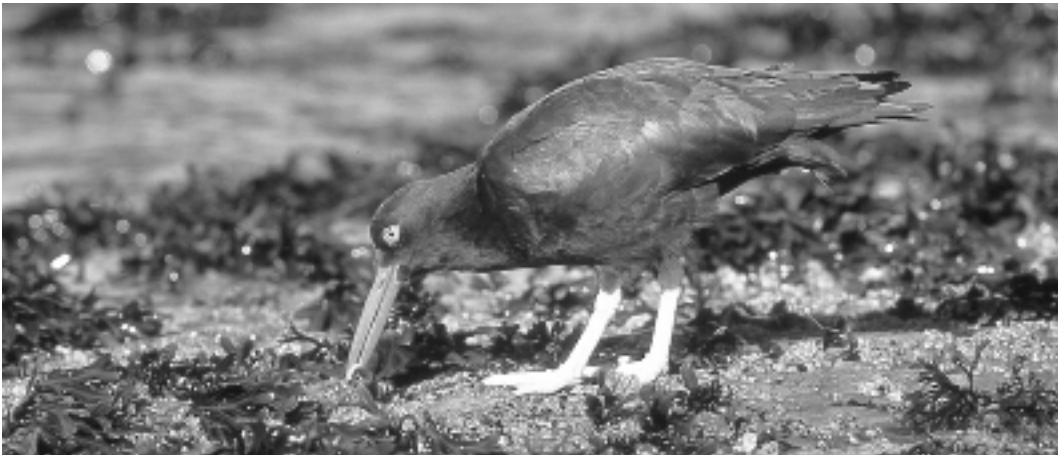
Figure 1. At least one-third of the world's population of Black Oystercatcher occurs in British Columbia.

Vancouver Island, although Hepburn had assisted with this synopsis. Fannin (1891:19) noted that the Black Oystercatcher was "An abundant resident along the coast of the Island and Mainland. Breeds throughout its range. Eggs, generally two, laid on the bare rocks close to the water." The only definite record of nesting before 1891 in southern BC that we located was the 1862 record. Munro and Cowan (1947) listed 1910 as the earliest year with documented breeding by Black Oystercatchers at Mandarte Island.