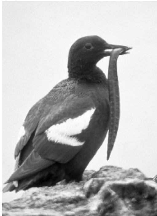
Figure 4. Pigeon Guillemot is a widespread coastal breeder in British Columbia and feeds mainly on small fishes obtained by diving in nearshore waters.

Pigeon Guillemot (Figure 4) is a common nearshore alcid that often feeds along rocky coastlines and breeds from the Chukchi Sea, Alaska, throughout most of the Bering Sea, south in the eastern North Pacific to Santa Barbara Island, southern California, as well as in the western North Pacific to the southern Kuril Islands, Russia (Ewins 1993, Gaston and Jones 1998). In British Columbia, eggs (usually two per clutch) are laid in rock crevices, burrows, or under driftwood on small islands (and occasionally in rock crevices in cliffs) on both the outer and inner coasts; it also nests in cavities on human-made structures in protected inlets and bays (Campbell et al. 1990). We identified the first five breeding records for Pigeon Guillemot at three locations in British Columbia as follows: