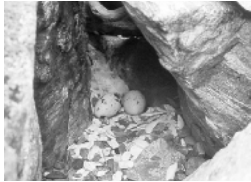
Figure 5. On Mandarte Island, BC, Pigeon Guillemots prefer to lay their eggs in cavities in loose jumbles of boulders along the beach (Drent et al. 1964).

(3) Four eggs were collected on the “west coast Vancouver Island” by Newcombe on 8 June 1892 (RBCM #E1,153 [two eggs], #E1,155 [one egg], and #E1,157 [1 egg]); #E1,157 was dated 8 June 1892, whereas the others were “June 1892”, which we have assumed also was 8 June. Although Seabird Rocks is on the west coast of Vancouver Island and was visited by Newcombe in June 1894 and June 1896, we believe that eggs collected on 8 June 1892 were obtained at Mandarte Island near Victoria. Newcombe and Fannin